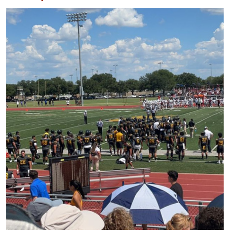
Watching my first Football game in person!