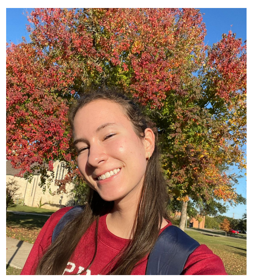
A photo of me in front of one of the beautiful trees at my campus!

My church is the Evangelical Church of Lutheran Confession in Brazil, and my