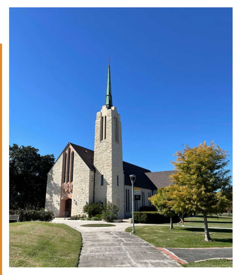
The beautiful TLU chapel