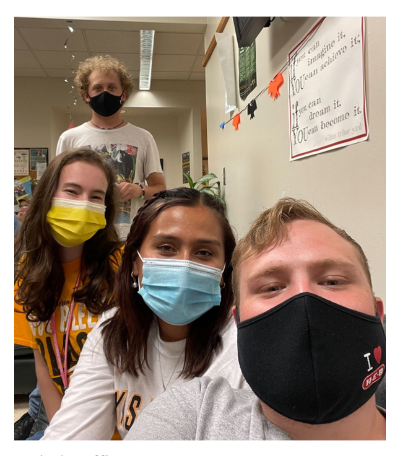
Pi Rho officers