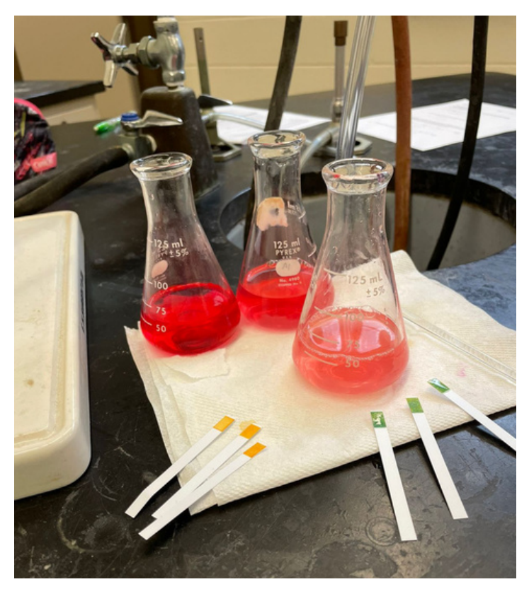
Fun experiments at the chemistry lab

Between chemistry and biology classes, which were fun and difficult sometimes also, I participated in events and activities like watching movies and decorating ornaments for Christmas, and clubs as well, such as Mexican American the Student Association (MASA) and the chemistry club, Pi Rho, in which I am the during the 2021-2022 treasurer period!